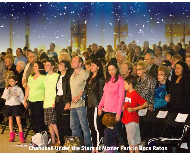
Chanukah Under the Stars at Mizner Park in Boca Raton

Celebrate the joyous holiday of Chanukah with Temple Beth El of Boca Raton and the local South Florida Jewish community at a beautiful evening under the night sky. The event will include a musical celebration of Chanukah and shabbat with a giant Lego menorah lighting. Dinner and snacks will be available for purchase including traditional latkes (potato pancakes). Kids will also enjoy bounce houses, face painting, tot shabbat and story time.